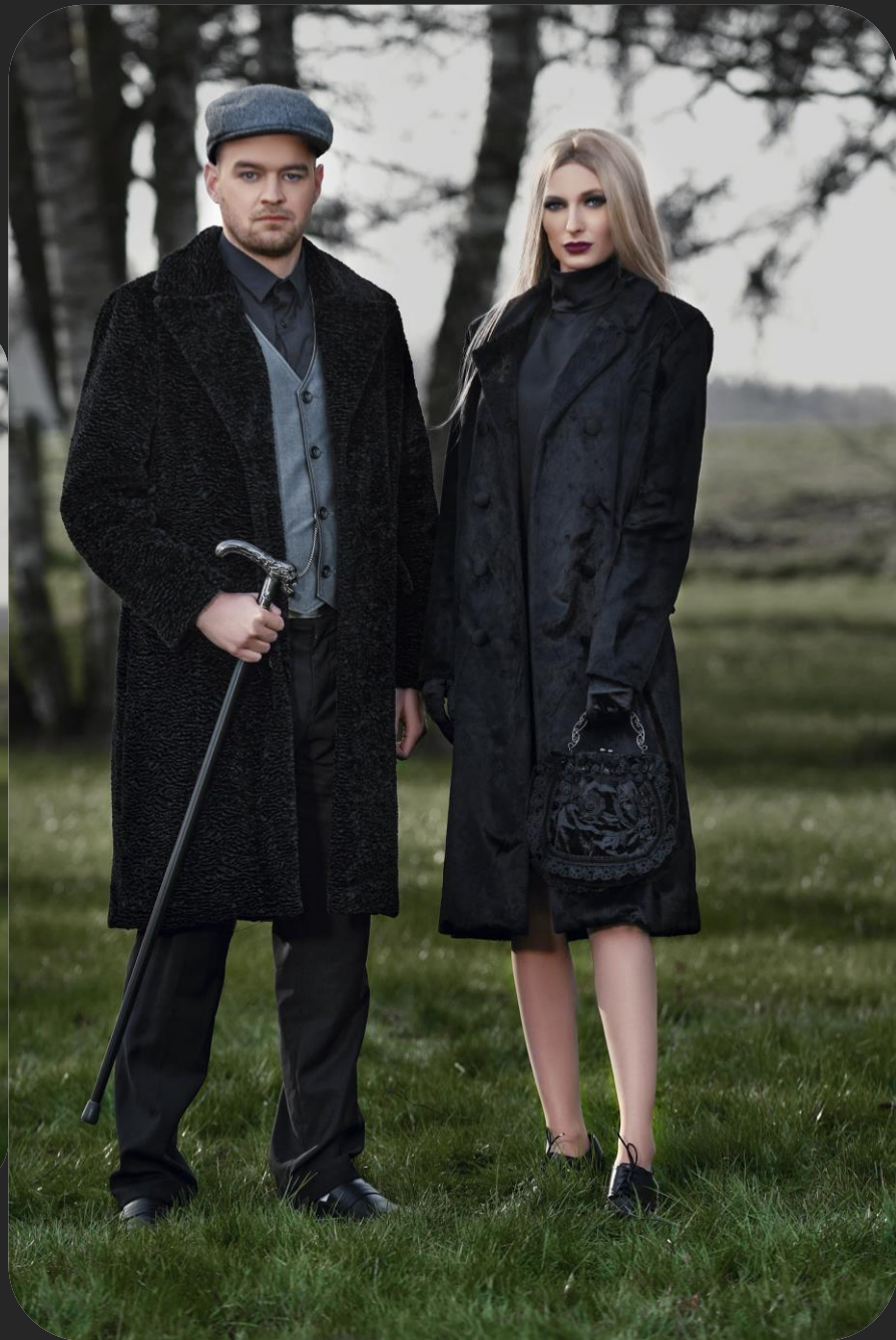
Gentleman's coat with zinc buttons