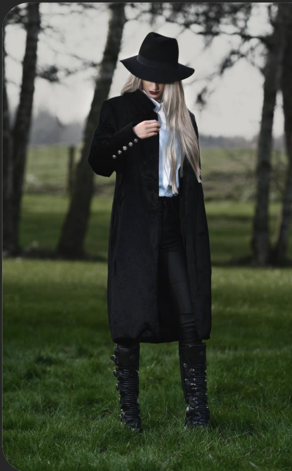
Coat with zinc buttons