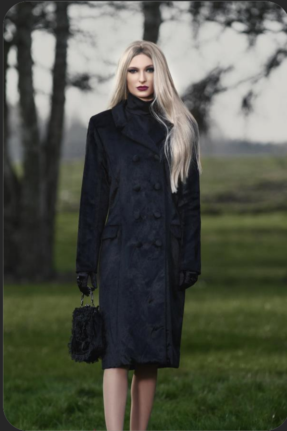
Lady's double breasted coat