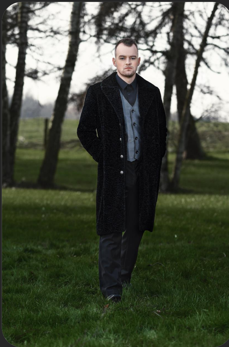
Coat with zinc buttons